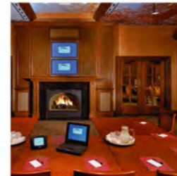
Lighting & Climate Control